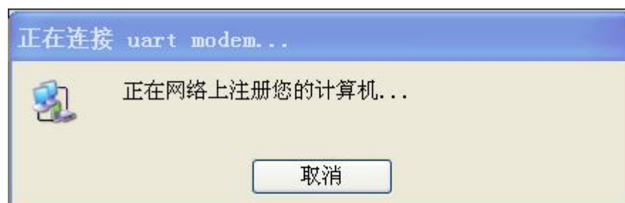
Virtual com port with DATA service