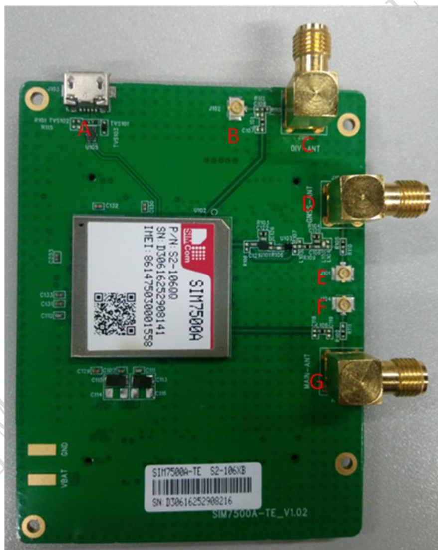
Figure 1: SIM7500A-TE components function

This chapter introduces the functions of each component. The components C/D/G are the MAIN_ANT/ GNSS_ANT / AUX_ANT SMA connectors, and the connectors B/E/F are reserved for dug.