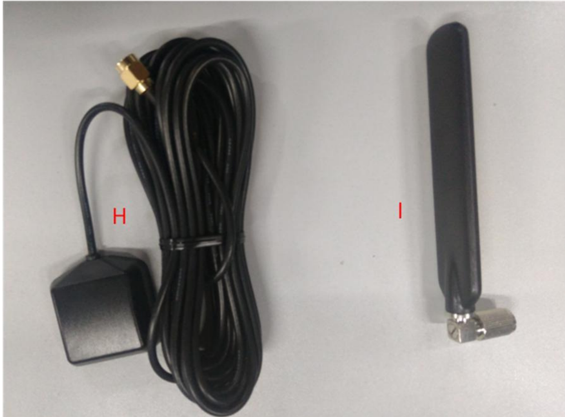
Figure 2: Antenna